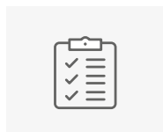
Large standard range/stock