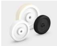
Load wheels for underwater use