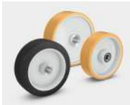
Load and drive wheels